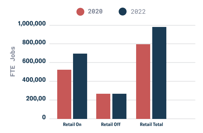
Figure 2 Retailing Jobs by Segment

The nature of malt beverage retailing varies by state. In some states, liquor stores sell malt beverages, in some grocery stores sell malt beverages, and in others, bars sell products for off-premises consumption.